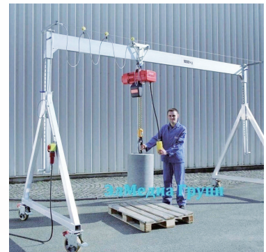
Widely used in lifting and handling work handling

• Note:We reserve the right to change parameters without prior notification.