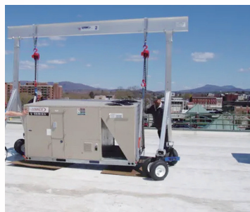
Widely used in mold manufacturing, sites heavy,object